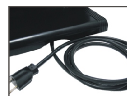
4. Easily arrange the cables inside the stand.