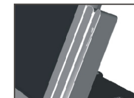
3. Triple Track Magnetic Stripe Reader for membership management or operator identification.