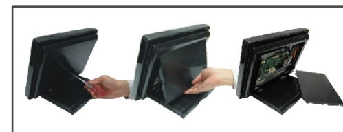
7. Easy to reach inner components.