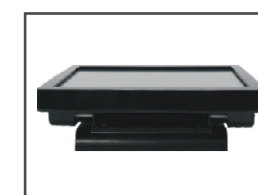
5. Thin / Flat Shape Design.