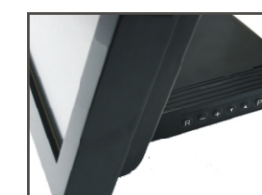
6. Power Switch and OSD on the side.