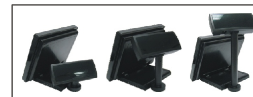
8. Customer Display VFD type ( 2x20 ) VFD Customer Display can be integrated to the back side of the system.