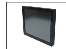
2. Wall Mount Functionality.